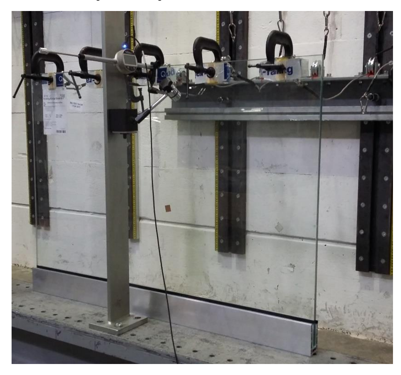
Typical arrangement for application of horizontal uniformly distributed line loading assembly

The deflection measurements of the upper edge of the glass were taken from a fixed datum point at the same level using a calibrated digital indicator.